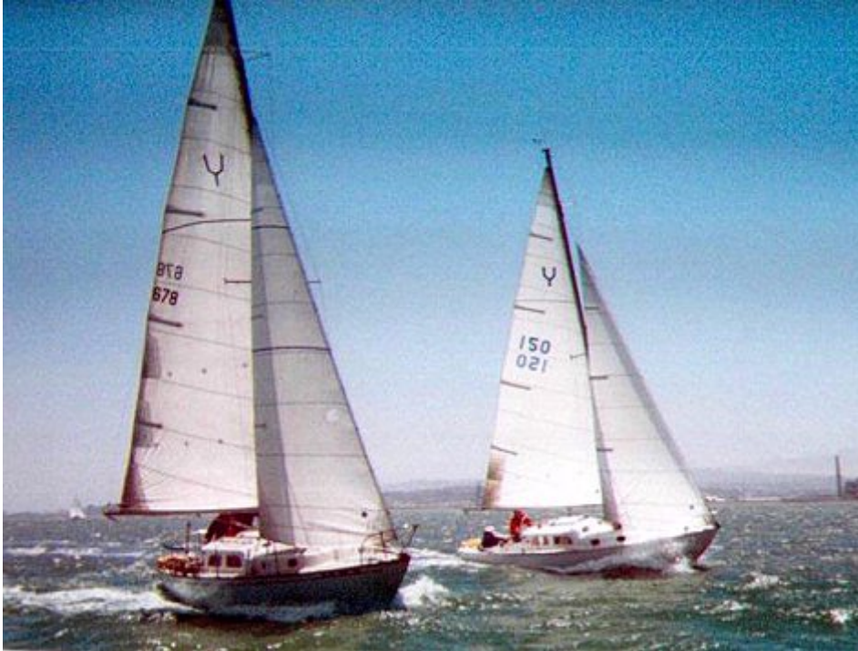
Figure 4. Two Classic Triton Sloops [ http://www.pearsontriton.com/history/billbell.shtml ]

A Northrop and Johnson ad in the Aug '60 "Yachting" cites the Triton sailboat as being introduced in Jan 1959. Sales to June 1960 were listed at 173 at a production schedule of 3 boats per week. The listed price was $9590 for the sloop. Everett Pearson developed the construction standards for fiberglass: "We designed the hull laminate from the waterline down so that the boat, laid over on its side with the entire weight of the boat resting on the keel and one square inch of the hull would yield not more than 1/2 inch and produce no structural damage to the boat." This is part of the reason so many of the early Tritons are still sailing today.